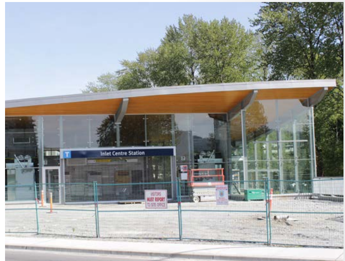
Inlet Centre Station – East Station House