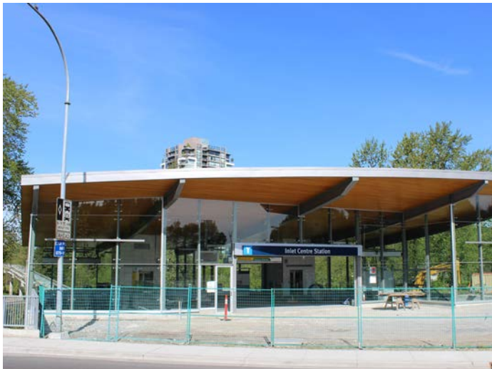
Inlet Centre Station – West Station House

The Evergreen Line Project is an 11-kilometre extension to the existing SkyTrain system in Metro Vancouver. It will be a fast, frequent and convenient SkyTrain service, connecting Coquitlam City Centre through Port Moody to Lougheed Town Centre in approximately 15 minutes. It will connect without transfer to the current SkyTrain network at Lougheed Town Centre Station and will integrate with regional bus and West Coast Express networks. When the line opens, Metro Vancouver's SkyTrain system will become the longest fully automated rapid transit system in the world.