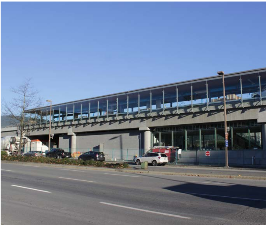
Lafarge Lake – Douglas Station

The Evergreen Line project is an 11-kilometre extension to the existing SkyTrain system in Metro Vancouver. It will be a fast, frequent and convenient SkyTrain service, connecting Coquitlam City Centre through Port Moody to Lougheed Town Centre in approximately 15 minutes. It will connect without transfer to the current SkyTrain network at Lougheed Town Centre Station and will integrate with regional bus and West Coast Express networks. When the line opens, Metro Vancouver's SkyTrain system will become the longest fully automated rapid transit system in the world.