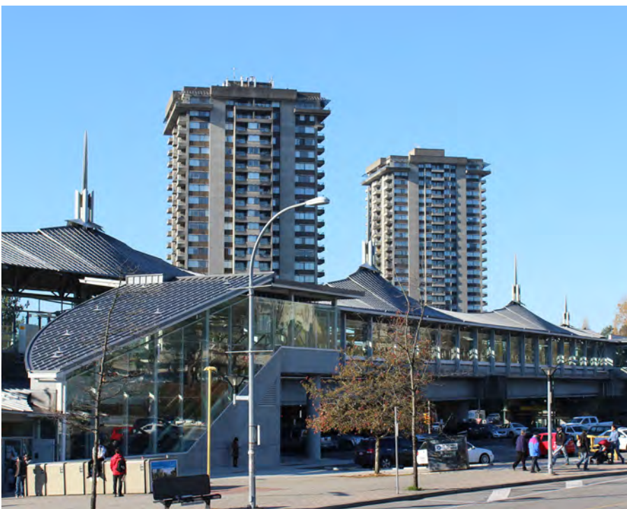
Lougheed Town Centre Station

The Evergreen Line project is an 11-kilometre extension to the existing SkyTrain system in Metro Vancouver. It will be a fast, frequent and convenient SkyTrain service, connecting Coquitlam City Centre through Port Moody to Lougheed Town Centre in approximately 15 minutes. It will connect without transfer to the current SkyTrain network at Lougheed Town Centre Station and will integrate with regional bus and West Coast Express networks. When the line opens, Metro Vancouver's SkyTrain system will become the longest fully automated rapid transit system in the world.